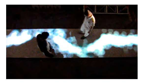
figure 2. The Wind Tunnel