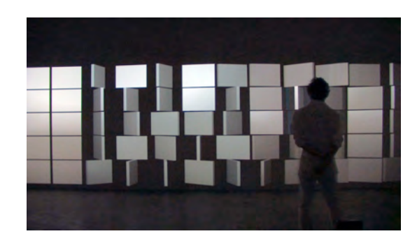
figure 1. The Prayer Drums.