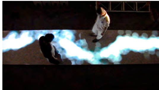
figure 2. The Wind Tunnel