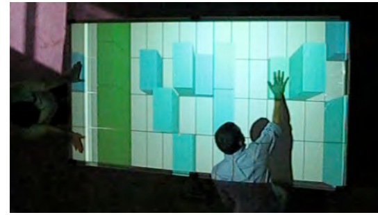
figure 3. The Beat Table