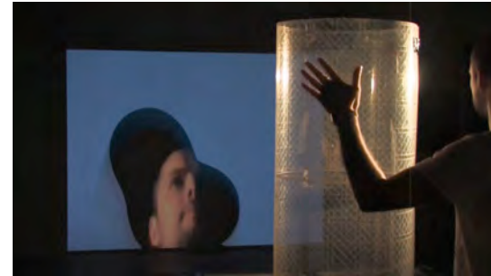
figure 4. Building Media Facade Prototype