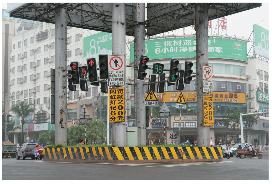
On the road, Nada, Hainan Province

It is undeniable that the convenient life created by the products and services of Chinese e-commerce companies is unmatched by most countries in the world. If only a person has a cell-phone, cash and cards (bank card, membership card, etc.) are no longer essential and stepping out of the house is unnecessary since almost everything (goods and services) can be bought online and delivered. It had led the vast majority of users gradually becoming accustomed to long-term coexistence with cyberspace barriers and habitually ignoring it while celebrating the convenience of the Chinese Internet. Let alone the generation born after the 90s who grew up in the cyberspace after the barriers were already established. It parallels the words of Emmanuel Goldstein, "Indeed, so long as they are not permitted to have standards of comparison, they never even become aware that they are oppressed" [5].